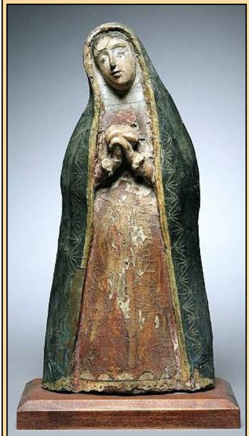
Our Lady of Sorrows, New Mexican folk art