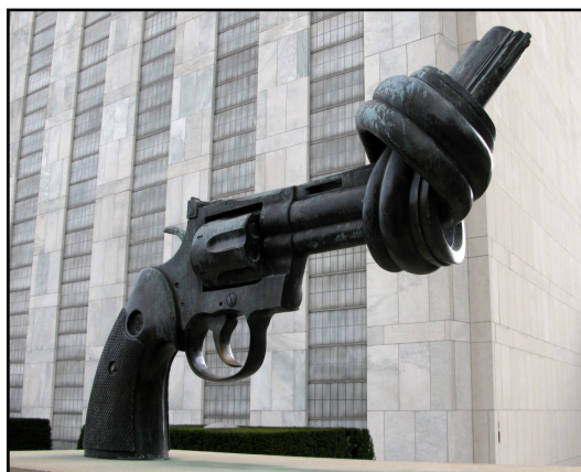
Sculpture by Carl Fredrik Reuterswärd

Give nations the courage to end war and end the production and threat of weapons of mass destruction Help us live the Loretto School Values by creating a world based on faith, community, justice and respect. With Loretto we pray for a time when all people —especially students in schools — can live their lives to the fullest without worries for their safety and that of their family and friends. Amen